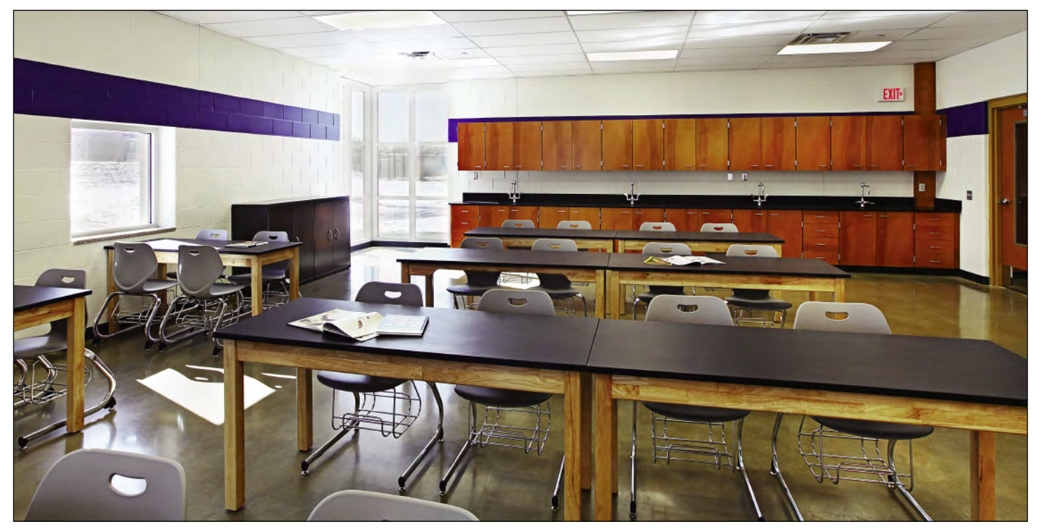
One of 42 classrooms in the new Voyageur middle and high school constructed last year in southwest Detroit.

plastic roof membrane finished the roof. The product was selected in part for it reflective ability that reduces the heat island effect, areas where heat tends to build up. The 40mil. Duro-Last membrane was also used for the remainder of the school's roof. Zimmer Roofing & Construction, Port Huron, did the installation.