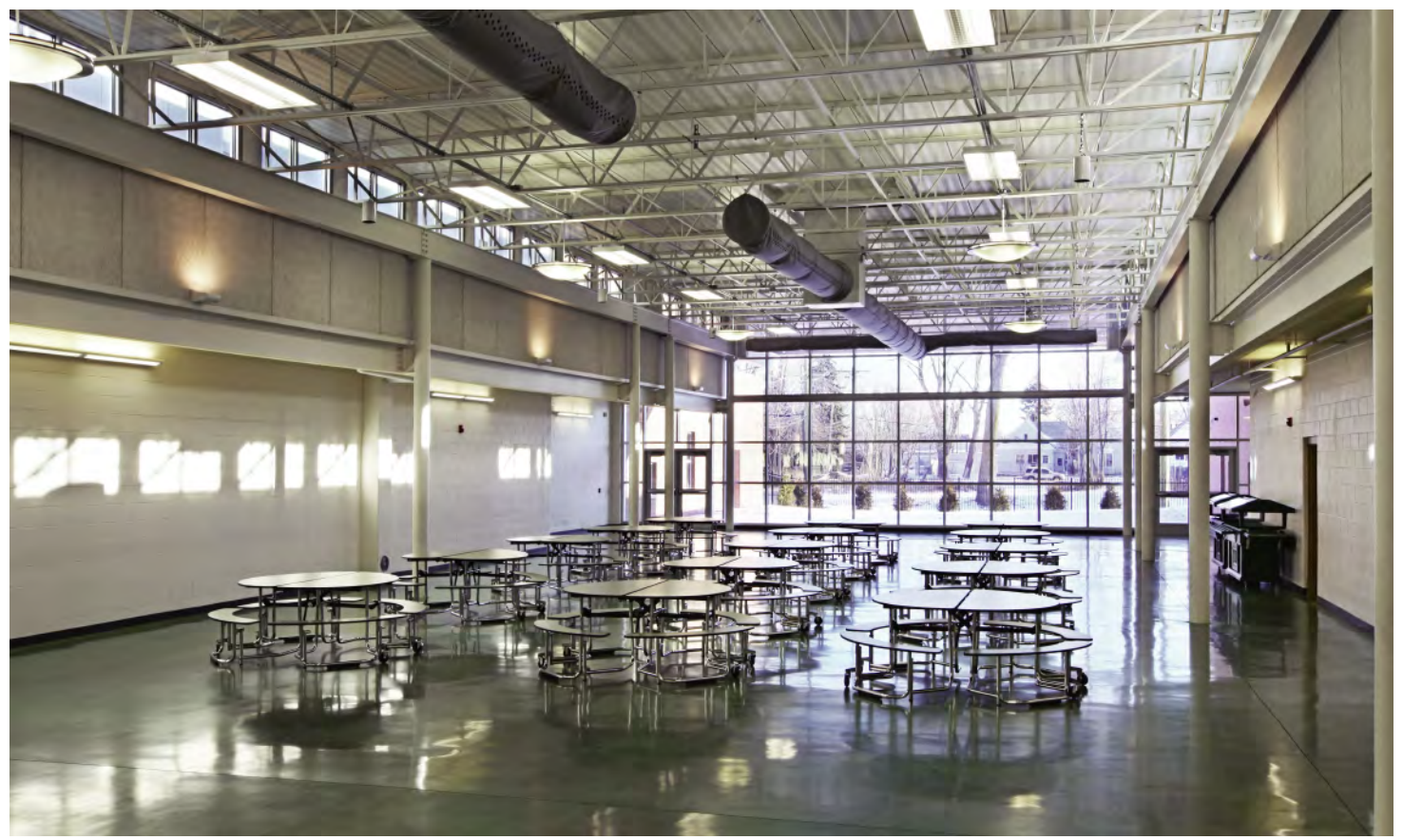
Students have access to the outdoor patio off the cafeteria. A glass curtain wall on the east elevation and clerestory windows permit lots of natural light to fill the space.